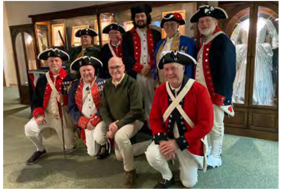
Also in March, Richard Montgomery Color Guardsmen participated in a DAR travelling exhibit in Dayton, Ohio

On Saturday, March 16th, the Richard Montgomery Chapter Color Guard posted the colors and participated in the 26th Annual Routes For Roots Workshop sponsored by the Miami County Historical and Genealogical Society at the Fort Piqua Conference Center in Piqua, Ohio.