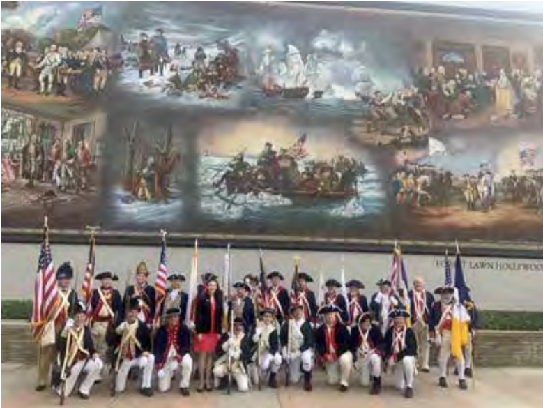
Massing of the Colors