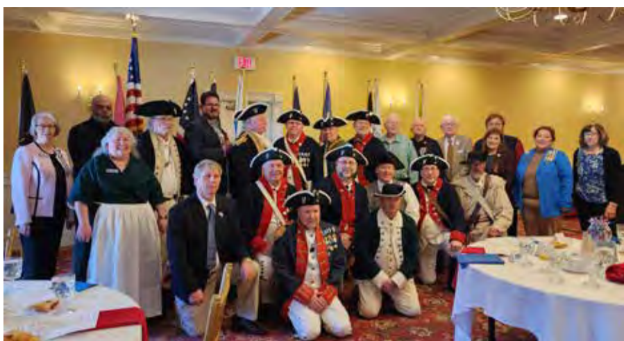
On Saturday, February 17th the Richard Montgomery Chapter with its Ladies Auxiliary gathered for its George Washington Birthday Banquet in Dayton, Ohio.