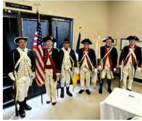
Annual DAR District XIII Luncheon