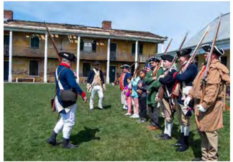
On March 30th Philadelphia Continental Chapter (PCC) combined their annual spring training with a fundraising event at Ft Mifflin. A storm torn the roof off the officer's quarters. The fort is owned by the city of Philadelphia but there is no funding for a new roof.