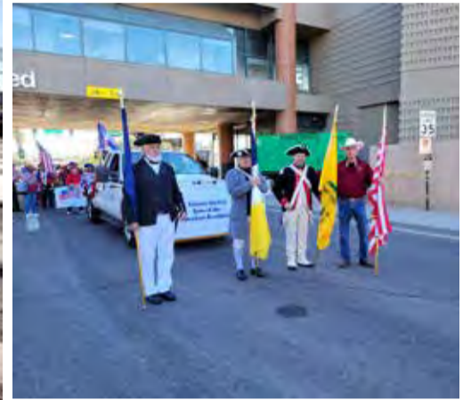
Parada Del Sol Parade