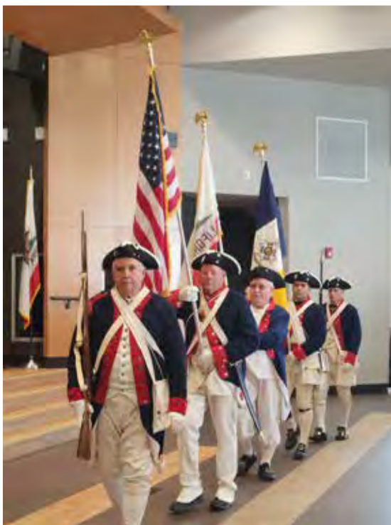
President's Day Celebration,