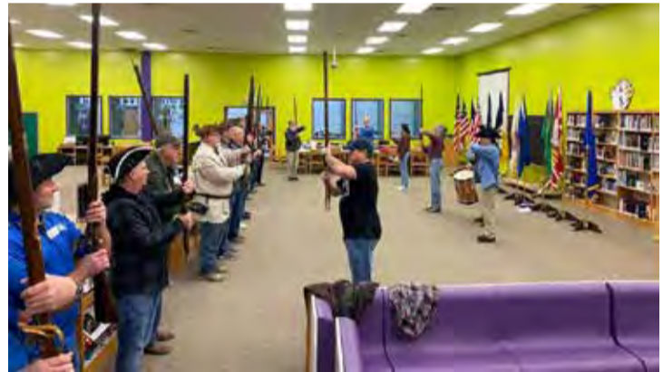
Photo Below: Participants of the color guard training in Frankfort.

Photo Right Bottem: Wreath presentations with a flintlock escort were part of the training.