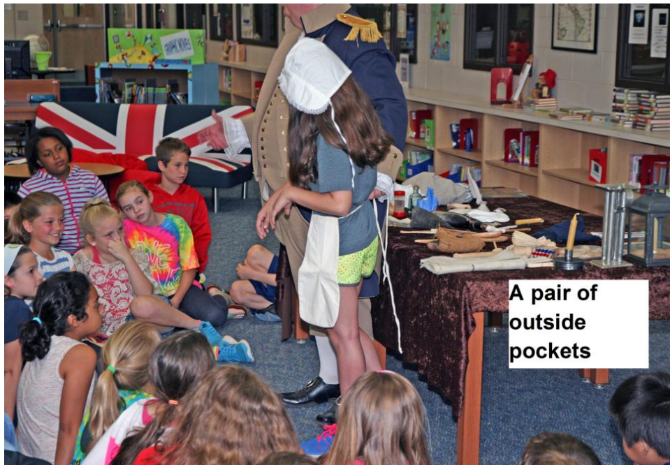
A pair of outside pockets