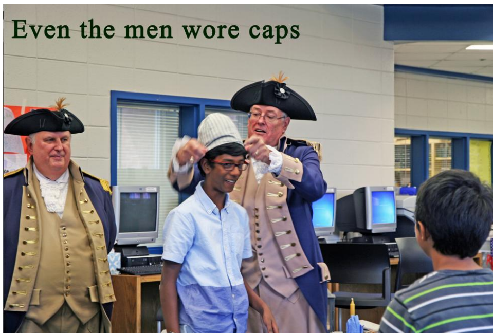
Even the men wore caps