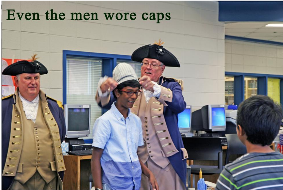
Even the men wore caps