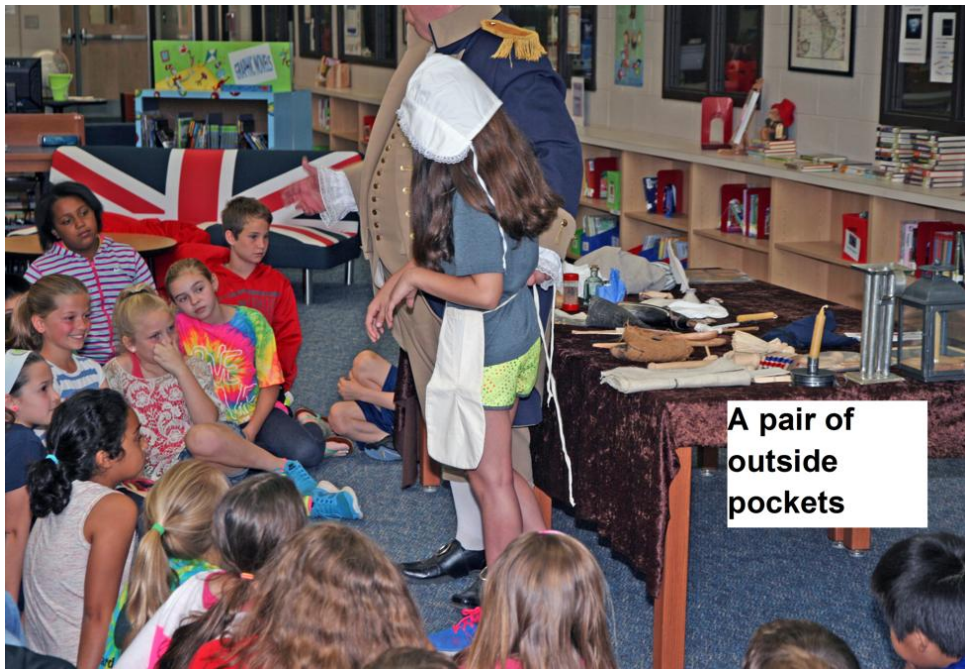
A pair of outside pockets