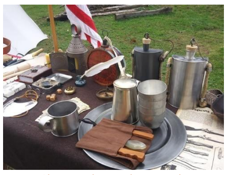
Patriot Chest and Traveling Trunk items