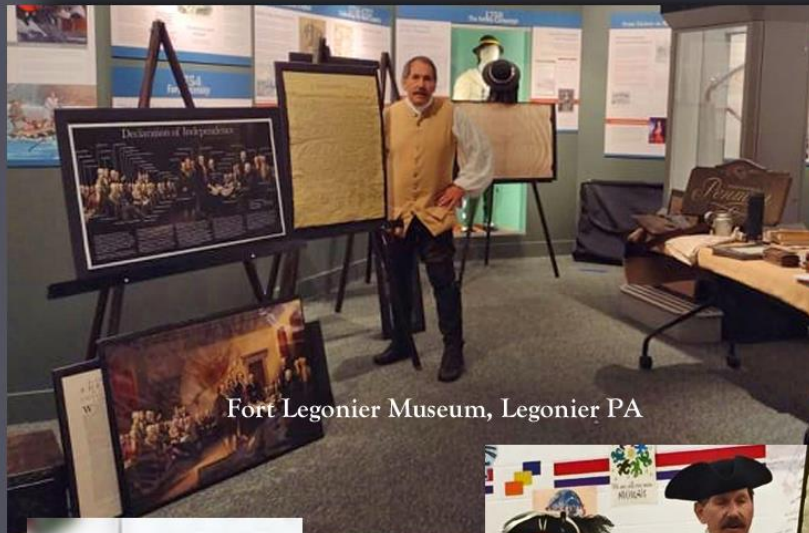
Fort Legonier Museum, Legonier PA