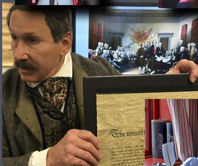
Indian Creek Elementary School, Indianapolis, IN