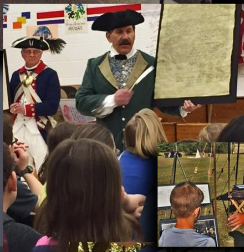
Stony Creek Elementary School, Noblesville, IN