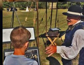
Rev War School Days Camden, SC