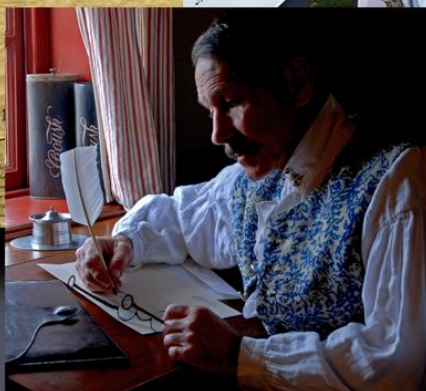
Colonial Williamsburg St. George Tucker House, Williamsburg, VA