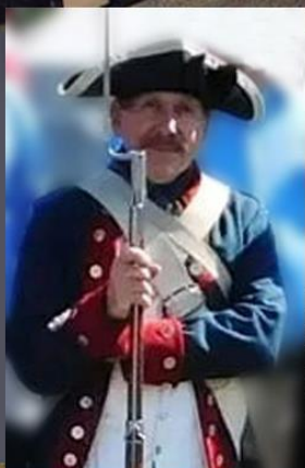
Drillmaster at Parkview Elementary School, Columbus, IN