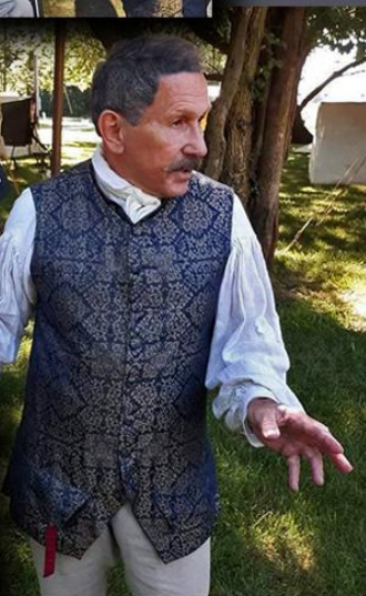
Lebanon, IN reenactment