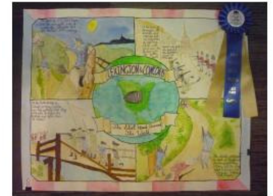
The Americanism Poster Contest

"The objects of this Society are declared to be patriotic, historical, and educational...." -Constitution of the SAR Article II