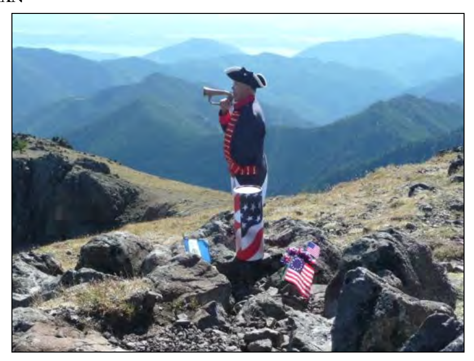
A Salute to Our Ladies

The online magazine of the NSSAR Color Guard.