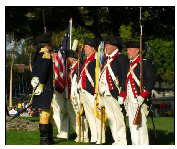
General Washington inspecting Lee's Legion