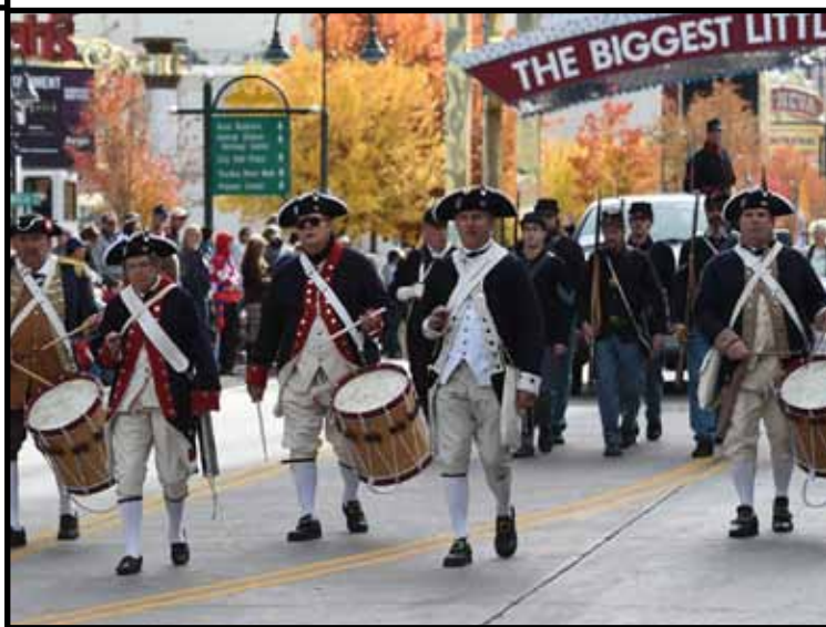
Nov 2014 - Members of the Northern Chapter F&DN were joined by Camp 25, Sons of Union Veterans of the Civil War for the Reno NV Veterans Day parade.