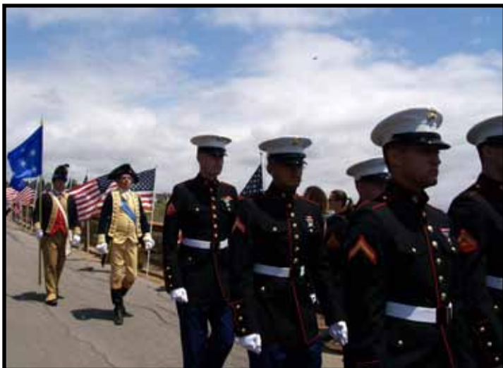
General Washington and his guidon march with a contingent of Marines in the 2015 Field of Honor