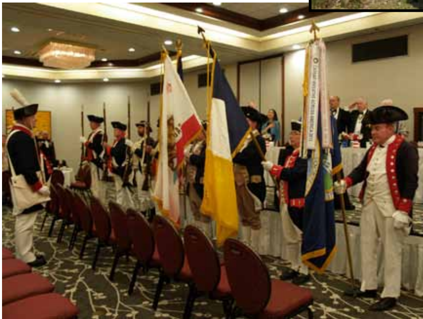
CASSAR Color Guard presents the Color for the CASSAR 140th Annual Spring Meeting banquet