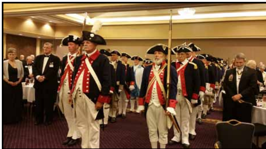
Color Guard at Wednesday Banquet