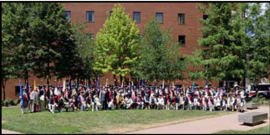
NSSAR Color Guard on parade, presenting at Memorial Service, and assembled following Memorial Service.