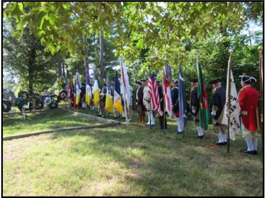
Color Guard members standing guard over the enclosed mass grave of the casualties of the Battle of Ramsour's Mill.

Casualties were difficult to assign since almost no one was wearing any sort of uniform. Estimates of dead on each side were between 50 to 70, with about 100 wounded on each side. The battle, in which muskets were sometimes used as clubs because of little ammunition, was fought between "neighbors, near relations, and friends". Casualties were buried in a mass grave near Ramsour's Mill after the battle ended.