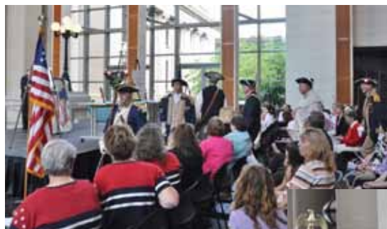
(clockwise from above) MOS-SAR Color Guard presenting the Colors; Pledge of Alligance by 3 Missouri C.A.R Societies; Attendees for the program "Fernando de Leyba and the Spanish

National Society of the Sons of the American Revolution (NSSAR) as an Annual SAR Historic Event for Silver Color Guard Medal qualification.