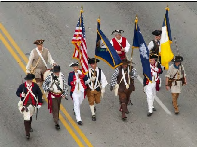
Left: The NSSAR Color Guard marching in the parade.