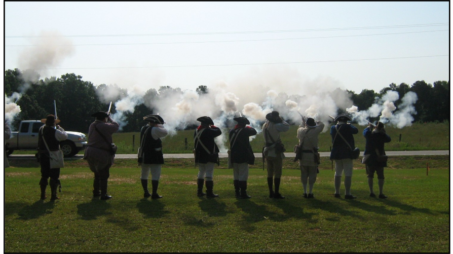
Photo above: Combined NSSAR Color Guard and New Acquisition Militia fire a volley in salute of the new flag pole. The fancy British war machine beat a hasty retreat after the volley.

As part of the dedication, a replica of Buford's Flag was raised along with the United States Flag.