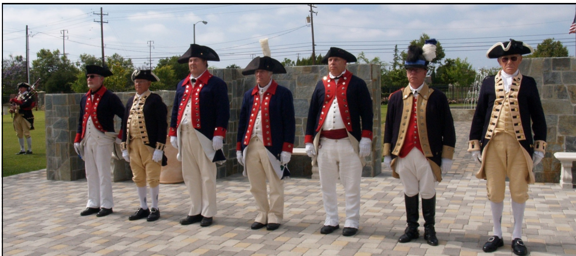
Honor Guard and Bagpiper assemble at the Memorial Service.