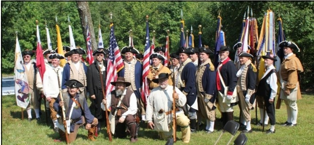
Photo below: Massed NSSAR Color Guard after the 232nd Anniversary of the Battle of Ramseur's Mill outside of Lincolnton, NC

Guardsmen from North Carolina, South Carolina, Georgia and Florida participated