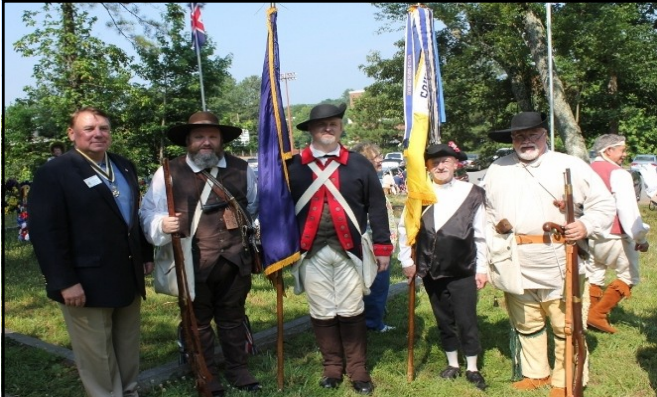
Photo above: South Carolina Society Color Guard at 232nd Anniversary of Ramseur's Mill