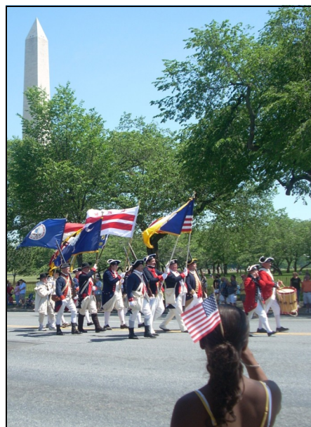
NSSASR Color Guard at 2008 National Memorial Day Parade

Also, any event where the President General is in attendance is automatically considered a national event.