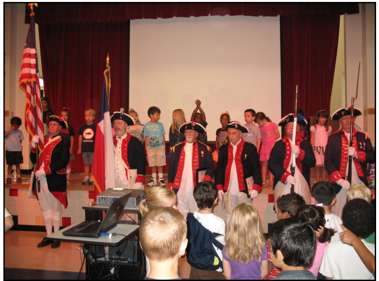
Plano Chapter Color Guard leading Pledges at Taylor Elementary