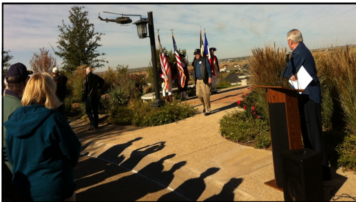
Plano Color Guard stands at attention while US Army helicopter flies over the Robson Ranch Veterans Day Ceremony