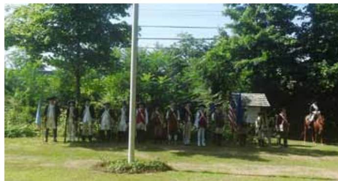
Aug 2016 Shade on a Hot August Day