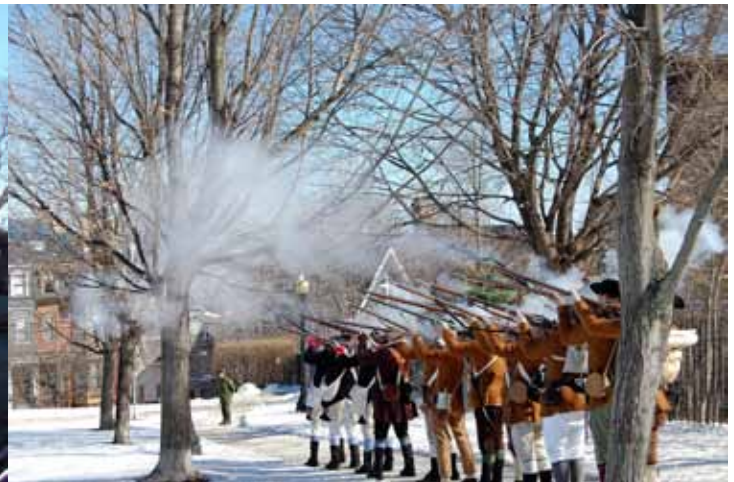
Ceremonies on the Hill - Henry Knox color guard and the Lexington minute men doing a musket firing