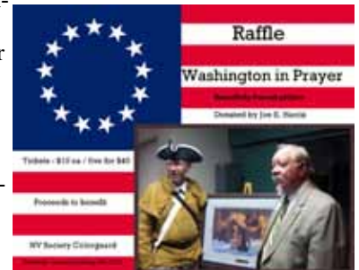
Promotional artwork used for fundraising raffle.