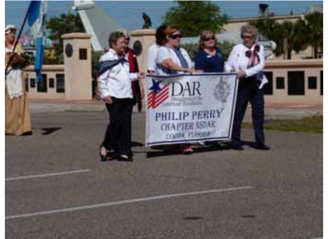
Pictured clockwise from above: The US Naval Ordnance Test Unit presenting the National Flag; Pnc of the 6 Brevard DAR Chapters attending; The Courageous Division Sea Cadets; Another Brevard DAR Chapter presenting their colors