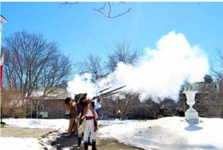
Henry Knox color guard and Lexington minute men firing.