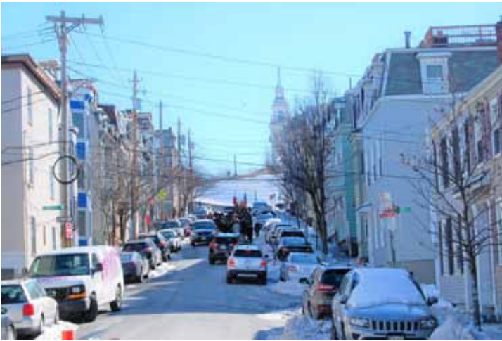
Evacuation day Same group going up the hill to Dorchester heights