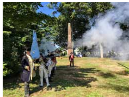
Aug 2016 Volley Fire