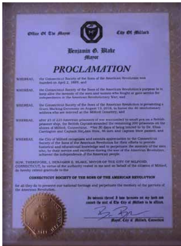
Aug 2016 Proclamation City of Milford