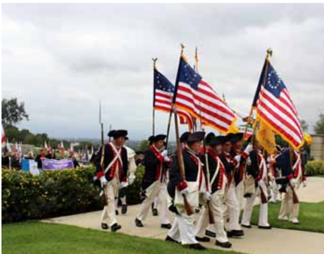
Lead group Orange County Chapter Color Guard followed by the Riverside Color Guard