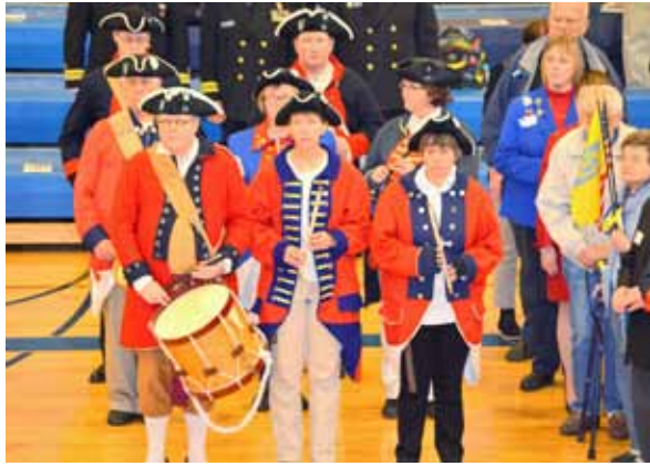
"Our SAR-DAR Fife and Drum Corps led the posting of Colors at the Massing of Colors - Five Fifers and three Drummers playing smartly to announce the National Emblem and five U.S. military branch colors!"