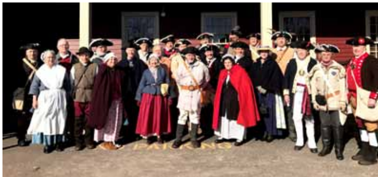
Group photo of the Connecticut Line