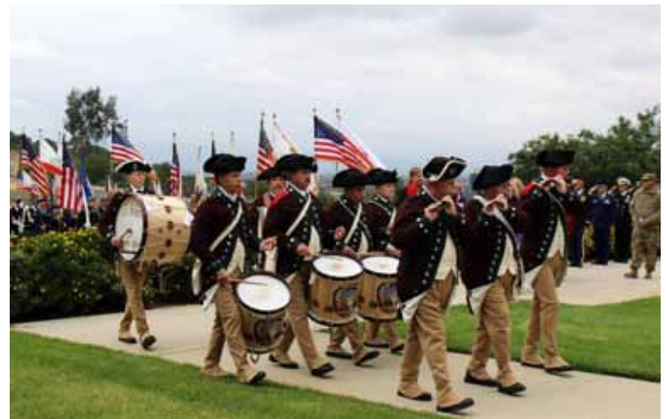
Los Angeles Fifes and Drums