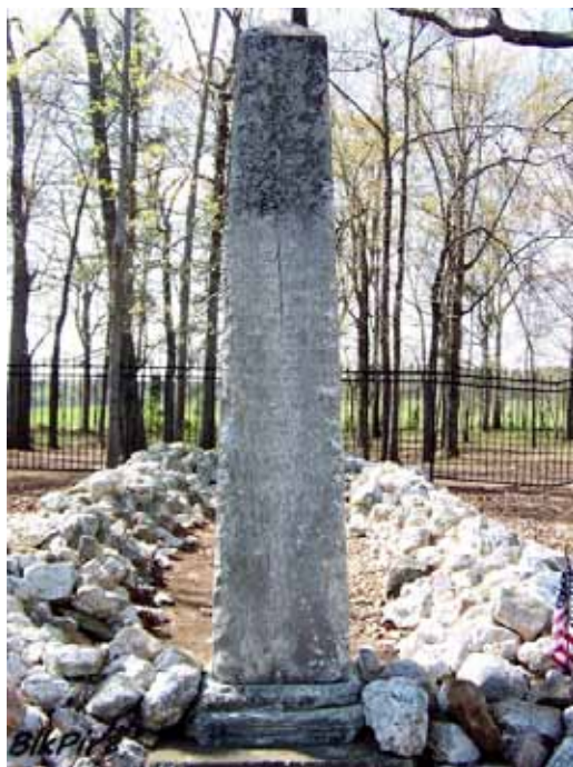
Battle of Waxhaws / Buford's massacre May 29, 1780