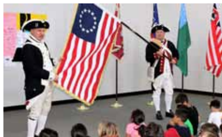
Revolutionary War Flags.