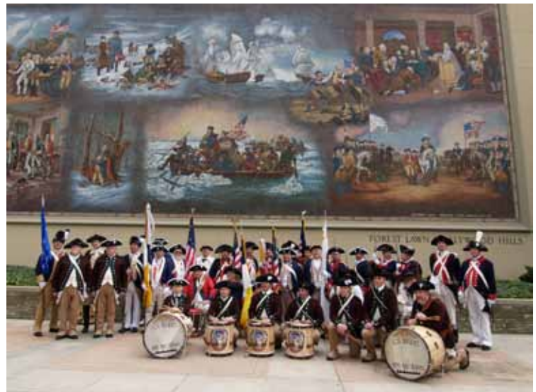
California Society, SAR Color Guard and the Los Angeles Fifes and Drums

Sons of Liberty Chapter - SOL is the host chapter of the Massing of the Colors General George Patton Chapter, Harbor Chapter, Kern Chapter, Orange County Chapter, Redlands Chapter, Riverside Chapter, Silicon Valley Chapter