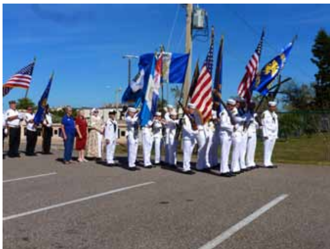
Pictured (left) - The Courageous Division Sea Cadets; American Legion Post 163