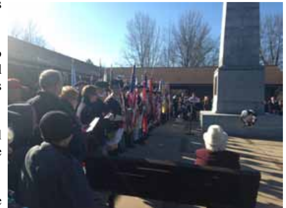
The NSSAR Color Guard at the National Monument

Prior to the placement of the NSSAR wreath by President General Brock, the NSSAR Color Guard formed an arch around the rear of the monument. After the wreath presentation, the Color Guard posed for pictures.