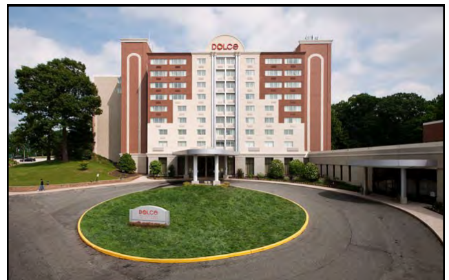
Dolce Hotel, Valley Forge