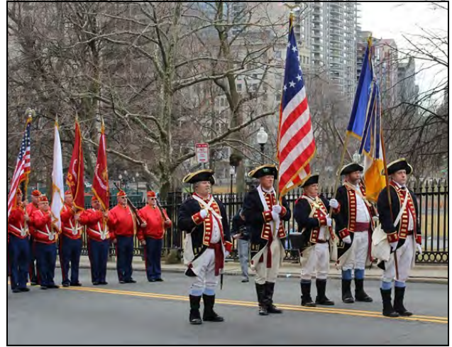
Color Guard members in front of Marine Corp League members at Boston Common.

The ceremonies began with a parade which formed at the statue of Samuel Adams at Faneuil Hall at 11 a.m., and wound through the city of Boston, finally arriving at Beacon Street, outside the State House, and concluded with a prayer, the firing of a 21 gun salute and the playing of taps by the Marine Corps League. Inside the State House, Lieutenant Governor Timothy Murray and other dignitaries also paid their respects during a moving tribute.