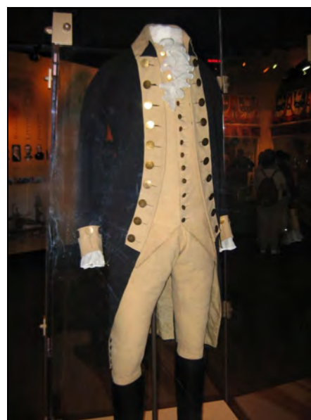
Uniform worn by George Washington on display at the National Museum of American History

Also, any event where the President General is in attendance is automatically considered a national event.