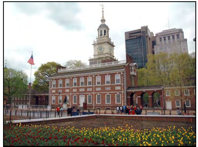
Independence Hall, Philadelphia