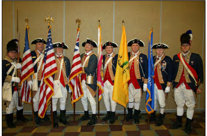
WISSAR Color Guard at WSLs Institute.