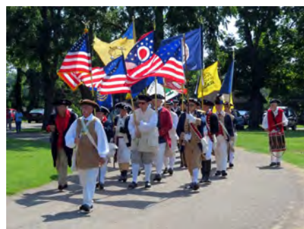
Color Guard Marches in to Post Colors

Fort Laurens was the first and only fort of the Revolutionary War established within the limits of what is now Ohio, and was built on the banks of the Tuscarawas River, now near the town of Bolivar, Ohio, in December of 1778 by General Lachlan McIntosh. The fort was intended to serve as a defense against attacks by the British and Native American Indians on settlers in the Ohio Country, and was to be a staging point in support of a planned attack on the British at Fort Detroit.