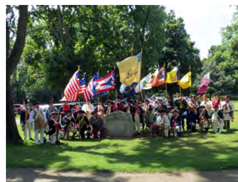
Color Guard Regiment