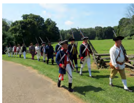
Musket Platoon Marches to their Post