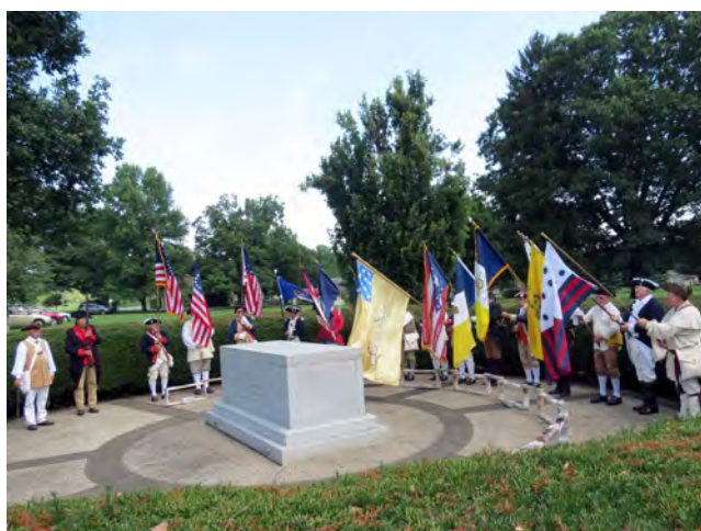
Color Guard Presents Arms for National Anthem