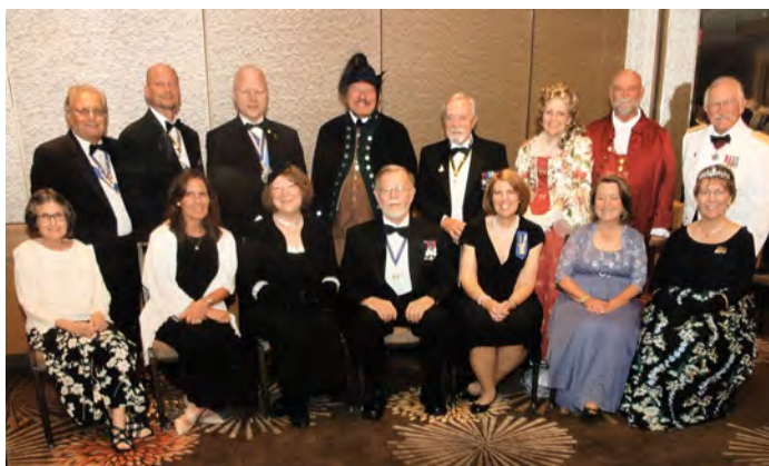
Ohio Society Members Attend the President General's Banquet at the SAR National Congress in Costa Mesa, California.

The National Society Sons of the American Revolution hosted its 129th Annual Congress in Costa Mesa, California from Friday, July 5th through Thursday, July 11, 2019 with 205 compatriots in attendance. The business sessions, meetings, and functions were held at the Orange County Hilton Inn in Costa Mesa.