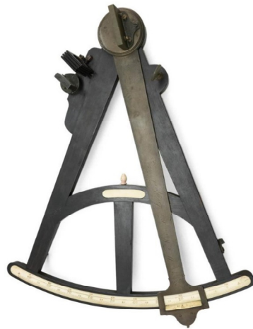
Ca. 1770-1775 Naval Quadrant Gift of the Sacramento Chapter SAR