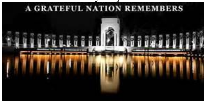
Picture of WWII Memorial on the National Mall in Washington, D.C.

The NSSAR is proud of our World War II Veterans. Of the 826 Compatriots who are registered members of the SAR World War II Veterans Corps, 566 remain with us. Their service remains permanently etched in our hearts and in granite at the entrance to our nation's World War II Memorial: "...we honor those twentieth century Americans who took up the struggle during the Second World War and made the sacrifice to perpetuate the gift our forefathers entrusted to us—a nation conceived in liberty and justice."