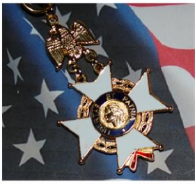
Thank you for your Service!