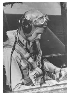
Lt (jg) George H. Bush

President George H. W. Bush is a decorated World War II Navy Pilot. He received the Distinguished Flying Cross and three Air Medals for combat operations in aerial flight against the Japanese in the Bonin Island, 1944.