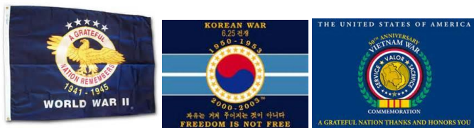
Slogans of the three Commemoration Flags are:

The United States American Vietnam War Commemoration Flag's heraldry is profoundly moving, especially as we say thank you this Veterans Day. The green laurel wreath about the flag signifies honor for all who served. The phrase " A Grateful Nation Thanks and Honors You " is the personal message to each veteran, civilian, family member, and all who served and sacrificed during the Vietnam War. The seal's blue background is the same color as the canton in the United States Flag. When placed next to the flags of World War II and the Korean War Commemoration Flags, the Vietnam War Commemoration Flag will signify the Vietnam Veterans taking their rightful place among generations of U.S. veterans.