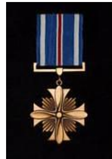
Distinguished Flying Cross