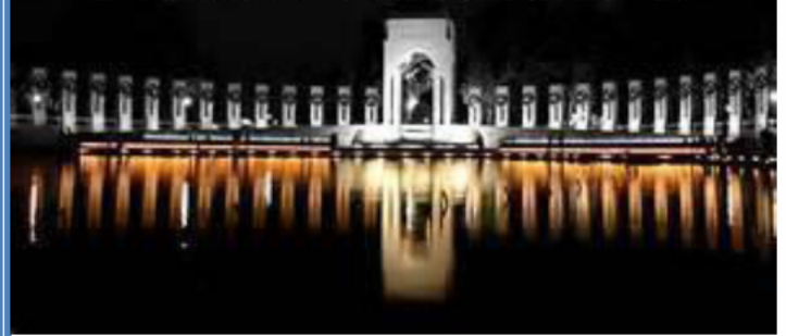
Picture of WWII Memorial on the National Mall in Washington, D.C.

The Grateful Nation Remembers Program. In keeping with the President General's initiative to ensure that each living World War II Veterans Corps Compatriot has an opportunity to be remembered on Veterans Day, all District Vice Presidents Generals will be sent electronic "Grateful Nation Remembers" certificates. Each certificate shall hold the names of those who are in good standing and still with us in his area of responsibility. Each VPG is requested to send the "Grateful Nation Remembers" list to the State Societies Presidents under his purview and request that each Compatriot identified be remembered and honored appropriately on Veterans Day. A list of those who are still with us will be published again during May.