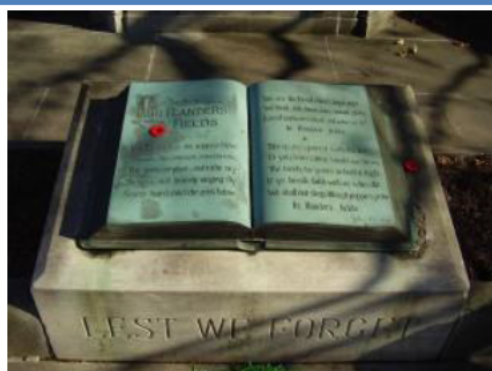
In Flanders Field--John McCare

"Badge over Glory" 08 Oct 2011