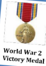
World War 2 Victory Medal

As adopted from the Words of Tom Brokaw in his book The Greatest Generation , every generation has its share of men who fully lived the art of manliness. But there may never have been a generation when the ratio of honorable men to slackers was higher than the one born between 1914 and 1929. These were the men and women that grew up during the Great Depression. They are those who went off to fight the Big One. And they are the men and women who came home from that war and built the nations of the Western World into economic powerhouses. They knew the meaning of sacrifice, both in terms of material possessions and of real blood, sweat, and tears. They were humble men and women who never bragged about what they had done or been through. They were loyal, patriotic, and level-headed. They were our Greatest Generation.