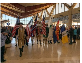
AZ CG leads them out.