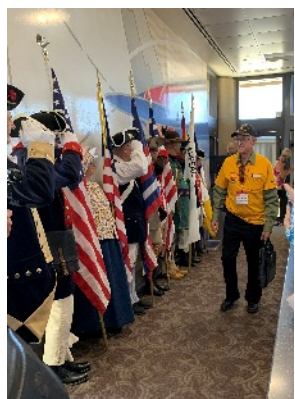
Each Veteran is Saluted