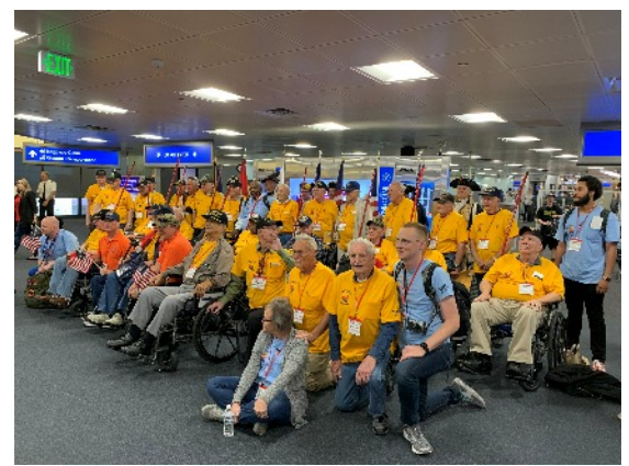
Two WWI and 26 Korean Veterans returned to Sky harbor. We can never thank them enough for their Sacrifices. Our ancestors fought for our liberty and these veterans have fought to keep us free. God Bless all our Veterans and God Bless America.