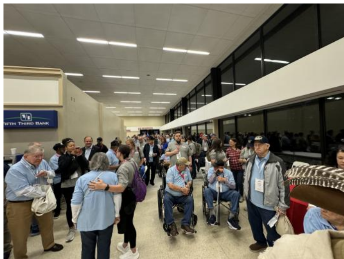
Members of the KY SAR Eastern Brigade Color Guard provided the Colors and lead the send off procession for Honor Flight Kentucky's first flight of the year.