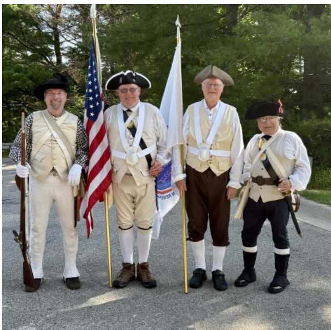
Michigan Color Guard members from the West Michigan Chapter of SAR. 4th of July Parade in Ada, Michigan.