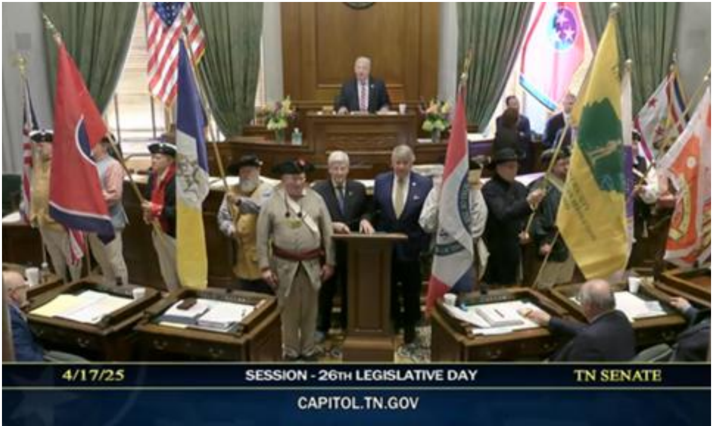
TN General Assembly Patriots Day

250th Anniversary "The Shot Heard 'Round the World" (Chattanooga) Tennessee Society Sons of the American Revolution Color Guard members in various period attire form prior to presenting and posting the colors as part of the opening ceremony of the Observation of the 250th Anniversary of the Shot Heard Round the World on Saturday, 19 April 2025 at Audubon Acres, Chattanooga.