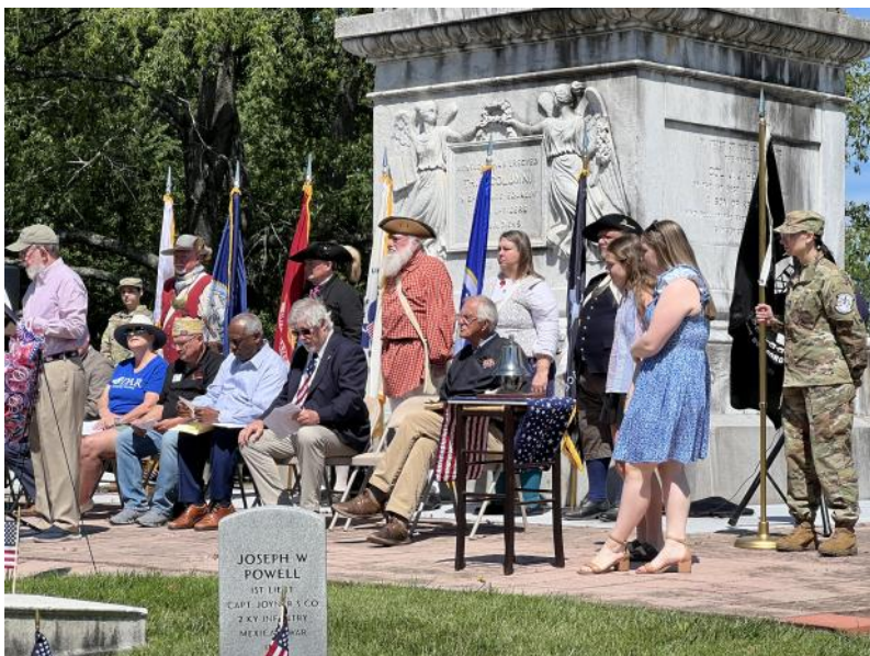
The Kentucky SAR Eastern Brigade Color Guard was invited to carry in the Service Branch Flags at the Memorial Day Service in Frankfort Kentucky.