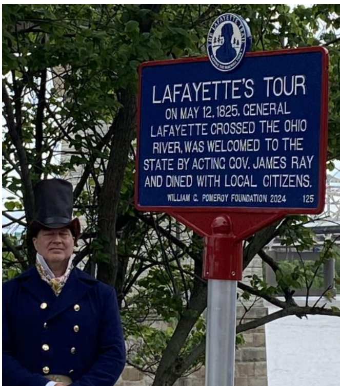
Members of the Kentucky, Indiana, and Ohio Society participated in Lafayette Bicentennial events in Louisville and Indiana. The events included a ceremony on each side of the Ohio River in Kentucky and Indiana, a parade across the bridge, and a Lafayette Trail Marker dedication.