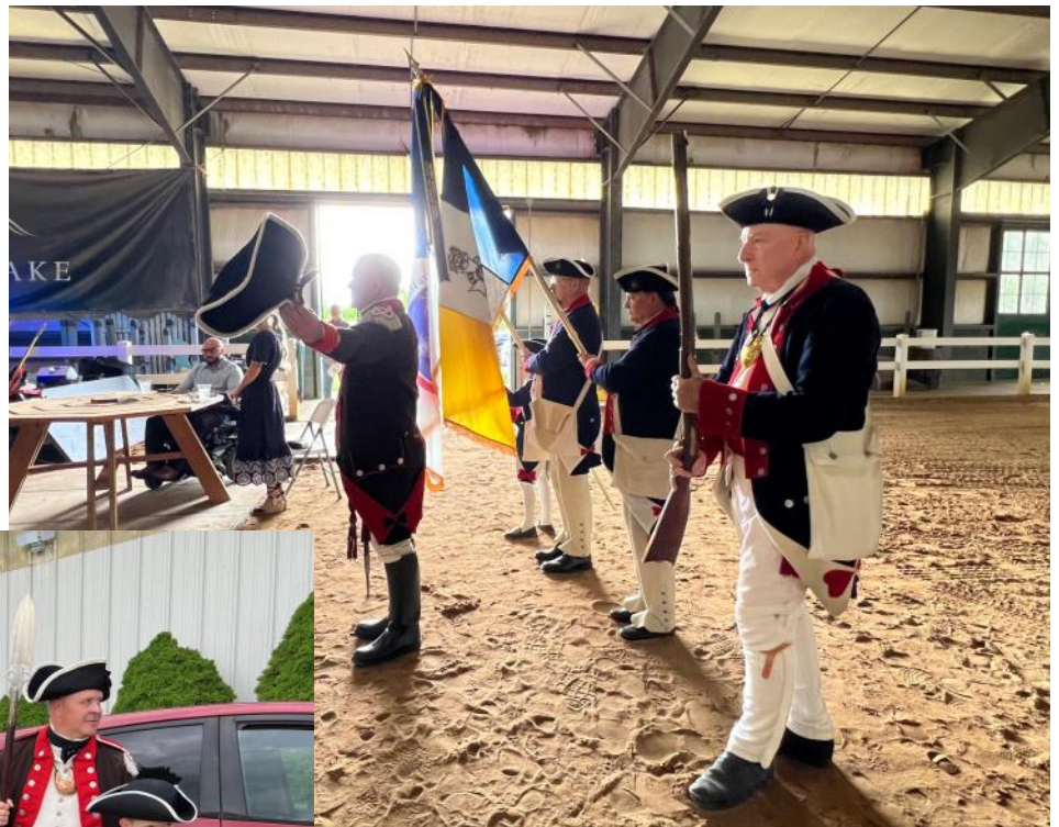
The Kentucky SAR Eastern Brigade Color Guard assist in the presentation of Colors at Queenslake Derby Party for Veterans and Law Enforcement.