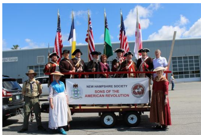
NHSAR Compatriots and spouses participated in the Littleton, NH Memorial Day procession to honor all veterans who did not return from the battle field.