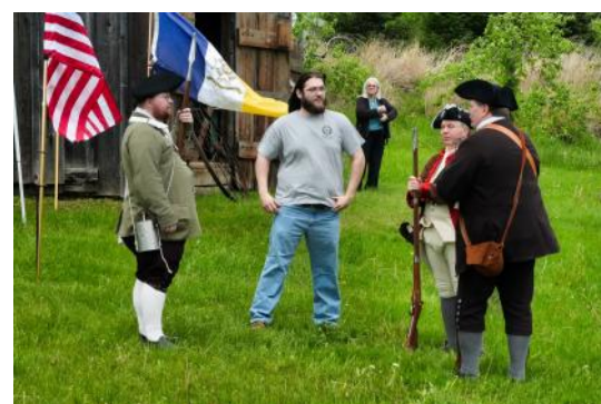
Members of the NHSAR staffed the static display and Color Guardsmen performed demonstrations during the Londonderry Historical Society's Spring Open House.