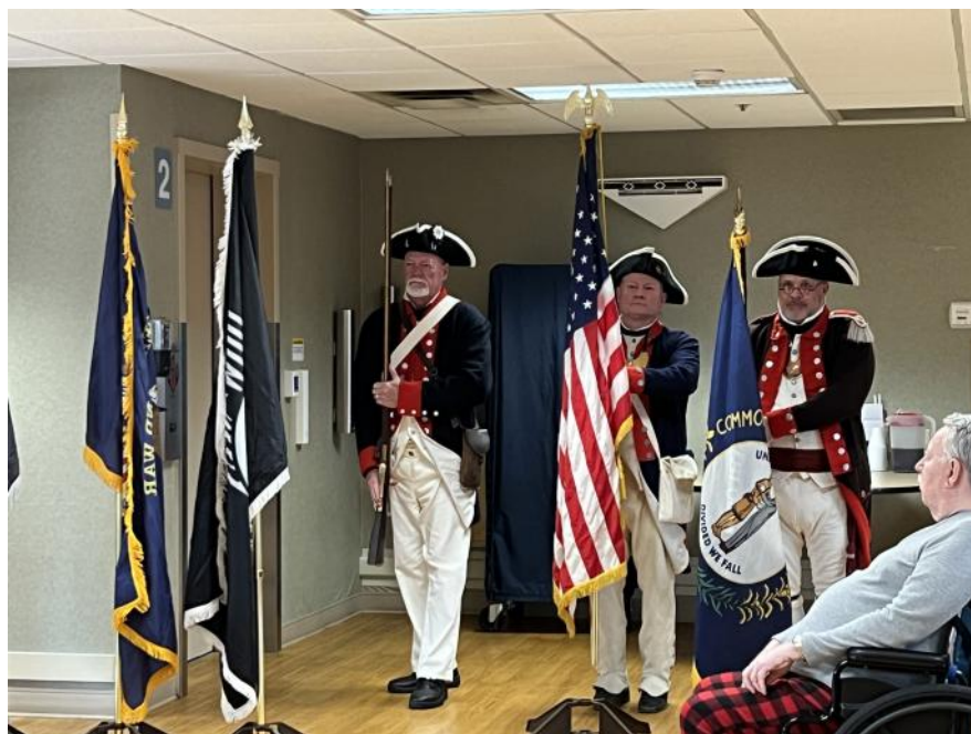
The Kentucky SAR President, President-Elect, and Secretary (all Veterans) visited Thomson-Hood Veterans Center with the local DAR for a Veterans Flag Day Celebration.