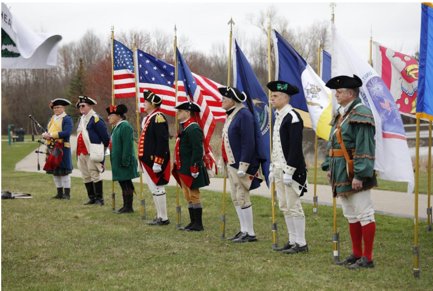
Liberty Tree Dedication on April 19th with the MISSAR Color Guard.