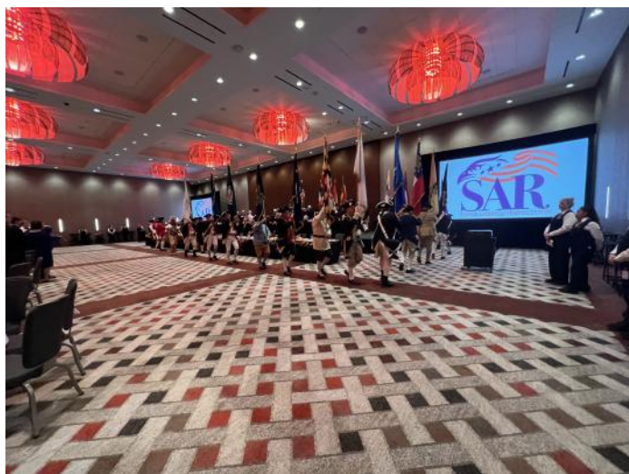
The Color Guard carries the colors to the stage prior to the PG Banquet.