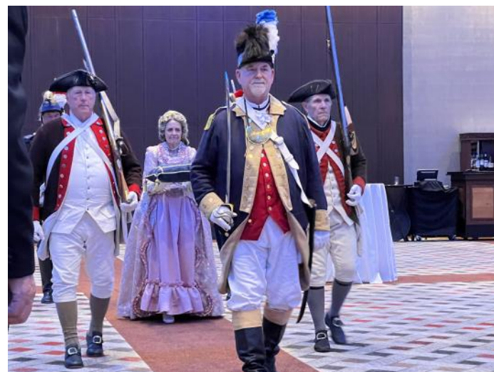
PG Tomme leads the George Washington Ring Ceremony the evening of the Installation Banquet.