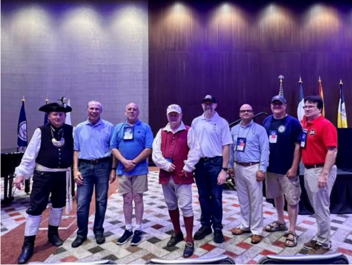
National Color Guard Command and Support Staff performing set up duties the evening before the Annual Memorial Service.

From July 12-18, the National Society held the 135th Annual Congress in Uncasville, CT. The Color Guard was active throughout the Congress in the Memorial Service and banquets.