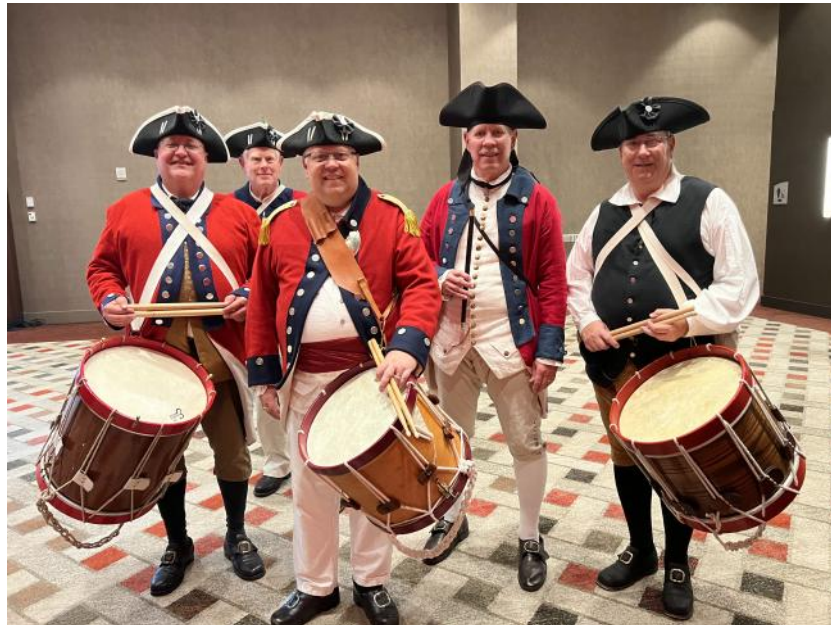
The Fifers and Drummers work to help keep the Color Guard in-step and add so much to each event where they participate.