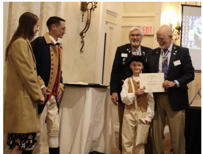
On April 26, 2025, the Wisconsin Society of The Sons of the American Revolution held its Annual Meeting at the Hotel Retlaw in Fond du Lac, WI