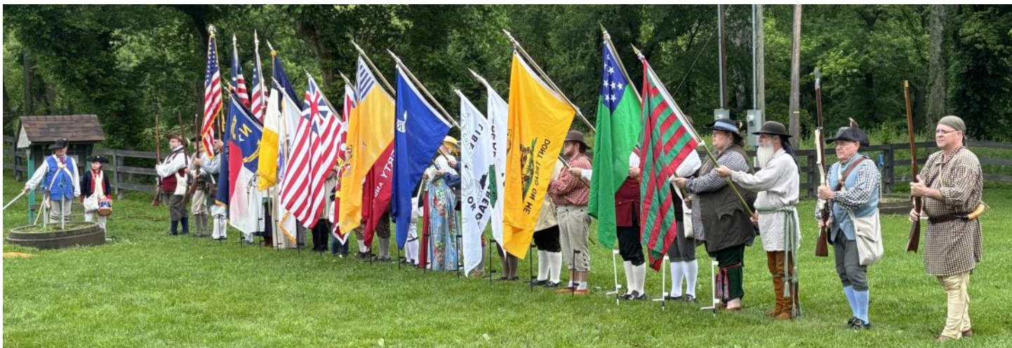
The Kentucky SAR Eastern Brigade Color Guard was invited to kickoff the 250th Anniversary Celebration of the Founding of Boonesborough. The Color Guard Presented the Colors for the Opening Ceremony. They also proved a Flintlock Salute and Mourn on Arms.