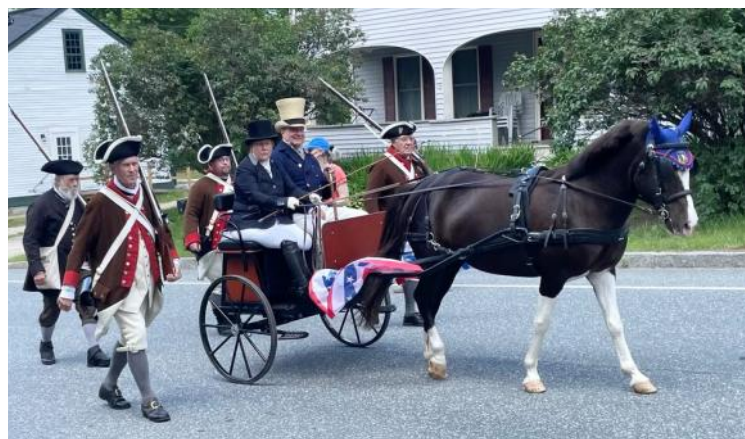
Stark's Company, NHSAR Color Guard supported the American Friends of Lafayette to commemorate the Bicentennial of Lafayette's Farewell Tour. Ceremonies were conducted in over a dozen towns over 4 days