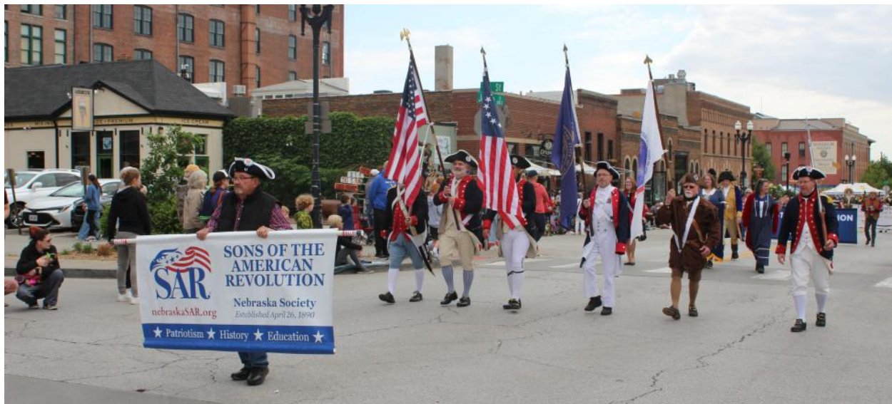
On May 24, the color guard marched in the Patriotic Productions Memorial Day Parade in Downtown Omaha. This is the 5th year for the parade, and we have marched in it every year.