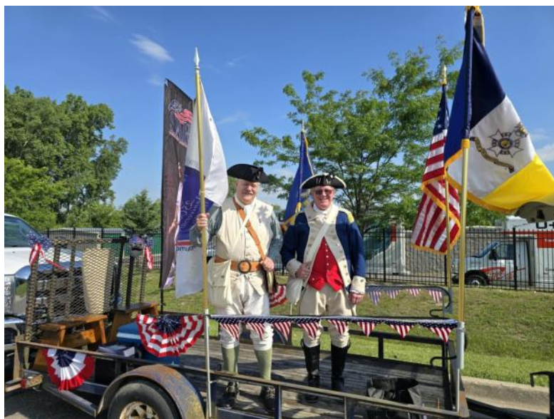
Fenton Michigan 4th July Parade. Color Guard members from the Paul Emery chapter MISSAR.