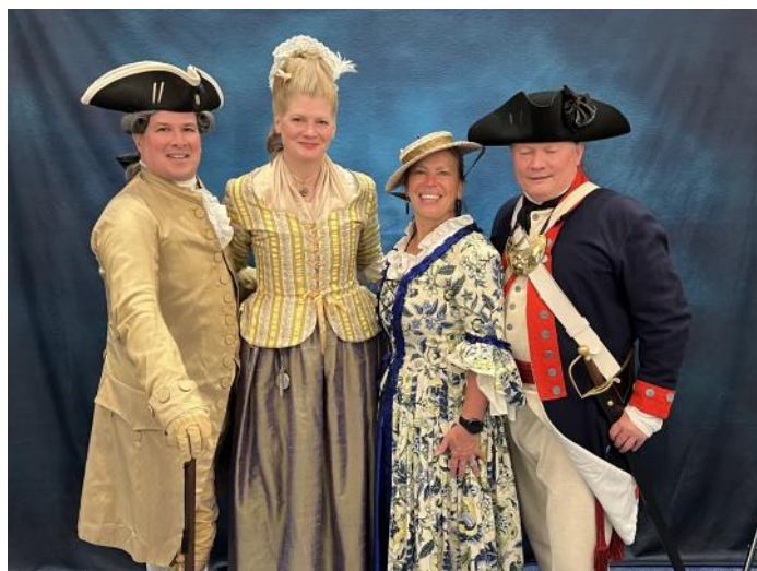
As always, we must remember the ladies who support our activities and initiatives throughout our State and National Societies.