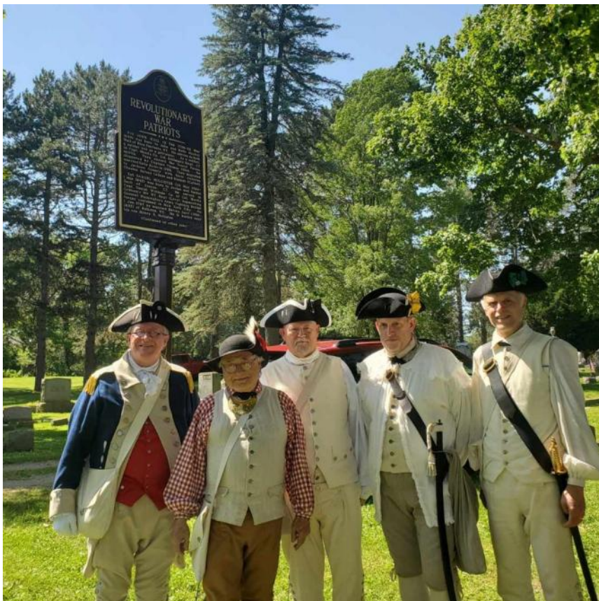
Wall, Hollister & Lincoln Patriot Plaque Dedication in Parma Michigan.