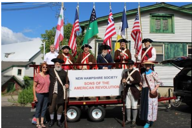
NHSAR Compatriots and spouses participated in the annual Ashland, NH Independence Day Parade.