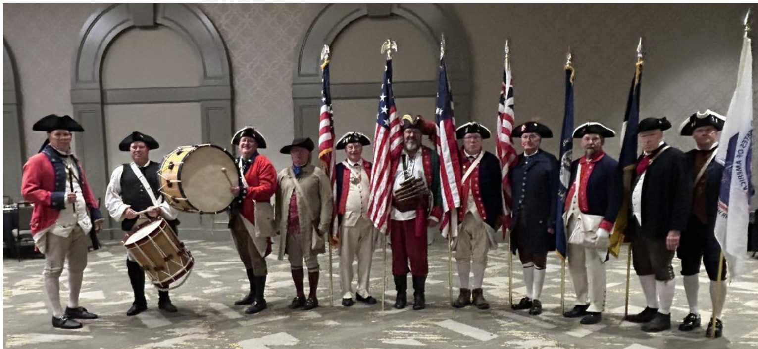
Color Guardsmen from Kentucky, Georgia, Michigan, and Tennessee carried in the Colors for the National Genealogy Society conference at the Galt House in Louisville Kentucky.