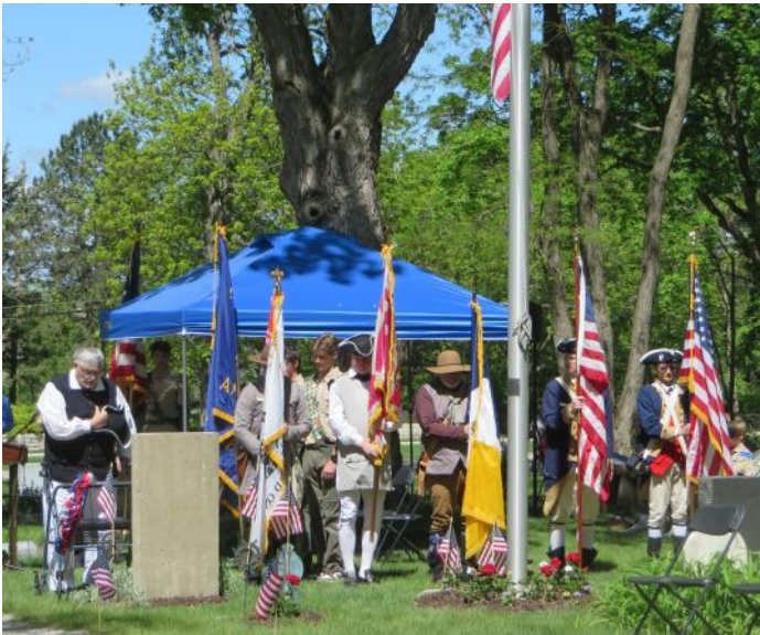
On Memorial Day, May 26, 2025, the Wisconsin Color Guard took part in a Memorial Day Ceremony at Oak Hill Cemetery in Brookfield, WI.