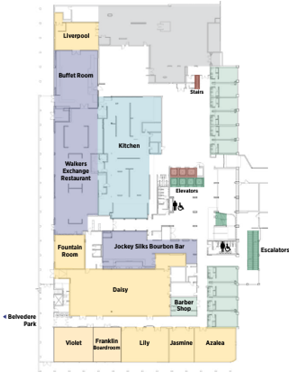
West Tower Second Floor