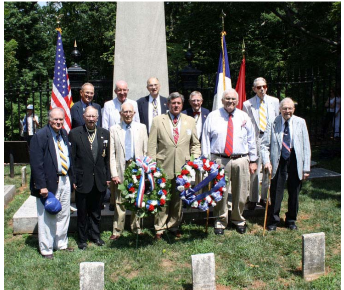
Members of the Thomas Jefferson Chapter gathered at the grave of their chapter namesake on July 4. The annual program is hosted by Jack Jouett Chapter of the DAR. The Thomas Jefferson Chapter provides the speaker and the Peter Jefferson Society of the C.A.R. provides the bugler.