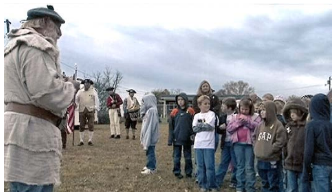
The General William Campbell Chapter hosted an "Honor the Veterans" program on Veterans Day. This Memorial Day, the Veterans Memorial Foundation of Abington and Washington County dedicated a permanent memorial to the Purple Heart. Children are an integral part all such programs.